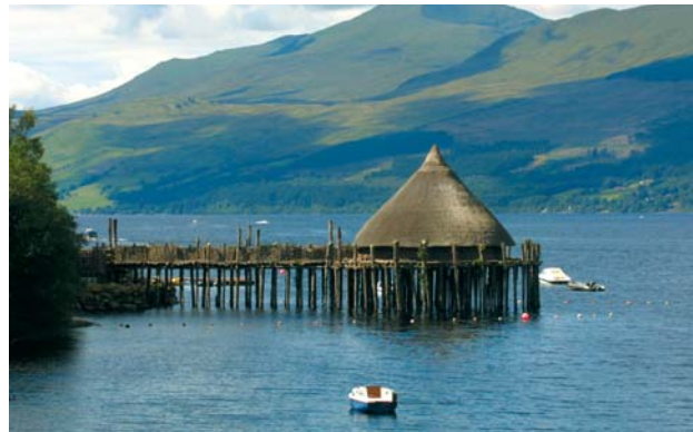
Scottish Crannog Centre, Kenmore