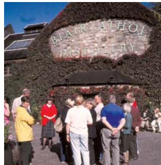
Bell's Blair Athol Distillery, Pitlochry