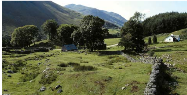
Beautiful Glen Lyon