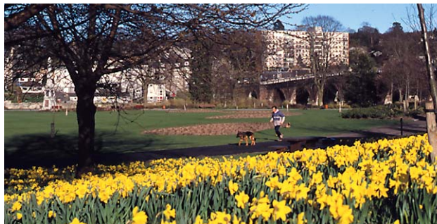
The North Inch, Perth