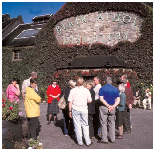
Bell's Blair Athol Distillery, Pitlochry

* Citylink Service 995 - timetable valid from 30th May to 2nd Oct.