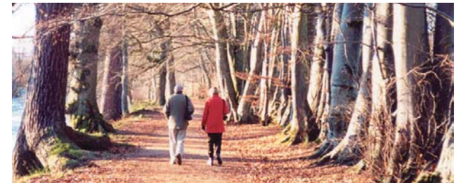
Lady Mary's Walk, Crieff

* Timetable may be subject to change from mid-August 2005 - check with Traveline.