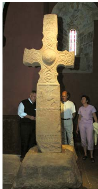
Dupplin Cross, Dunning