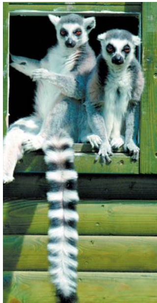
Ring-tailed Lemurs at Camperdown Wildlife Centre, Dundee

Contact Traveline or TIC for weekend services.