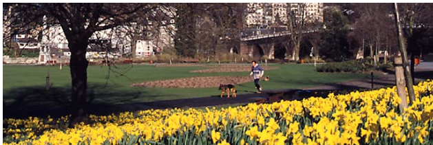
The North Inch, Perth

Journey time 30 minutes approx. Times given are for Monday to Saturday only. No Sunday service.