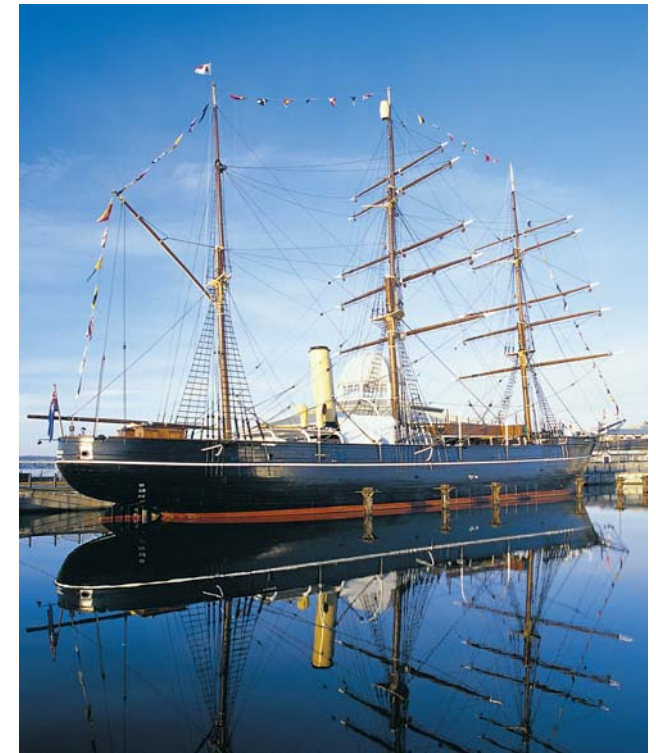
RRS Discovery, Dundee