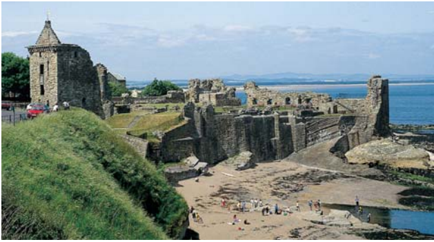
St Andrews Castle, St Andrews