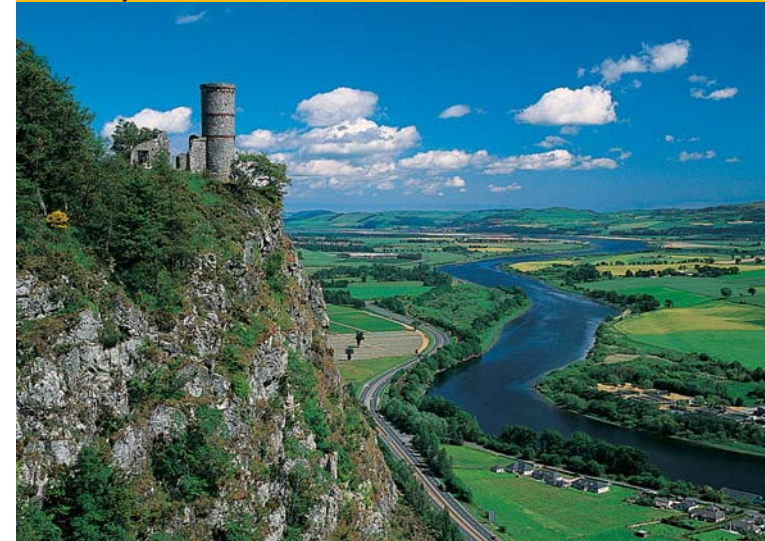
View from Kinnoull Hill, Perth