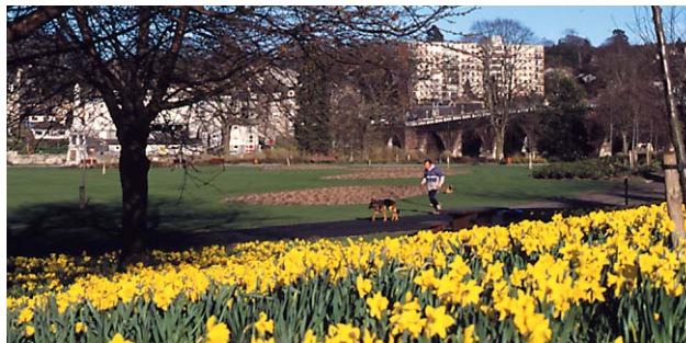
The North Inch, Perth

Contact Traveline or TIC for Sunday service.