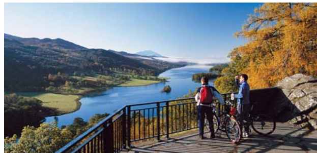
Queen's View and Loch Tummel